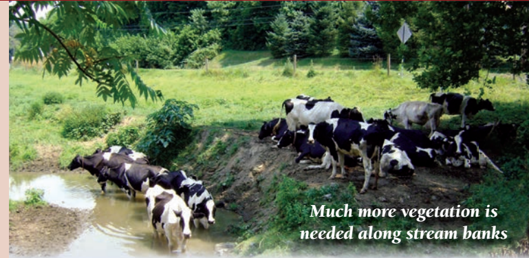
Much more vegetation is needed along stream banks

Any agricultural construction activity affecting 1 acre or more requires a Stormwater Management Plan and an NPDES permit, the same as required for all other types of construction. For example barn expansions or manure storage facilities require a permit.