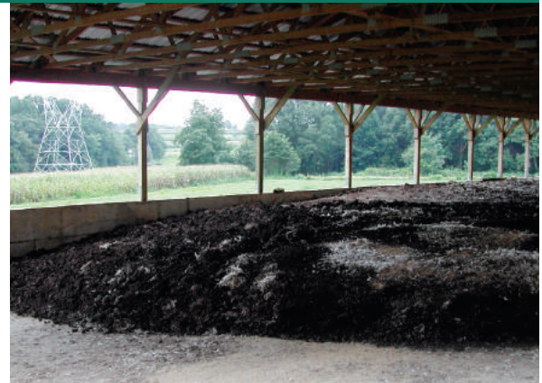
Covered manure storage on a poultry farm. The odor management regulations addressed animal housing and manure storage facilities but does not include land application of manure.